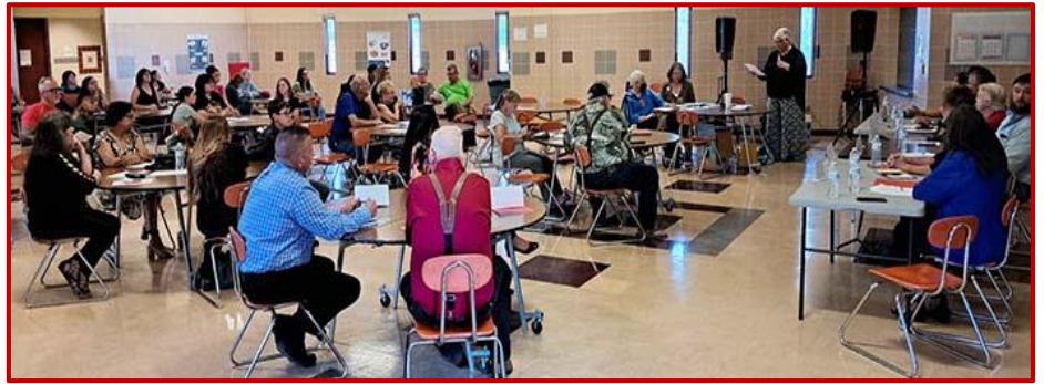
The League has conducted several candidate forums like this one in Tularosa in 2024 that draw large crowds from the local community.