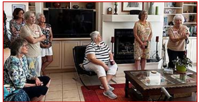
The June Potluck and Social was a great time to network and meet other LWVSNM members. The next scheduled social is in December when the organization invites local lawmakers to discuss legislative issues.