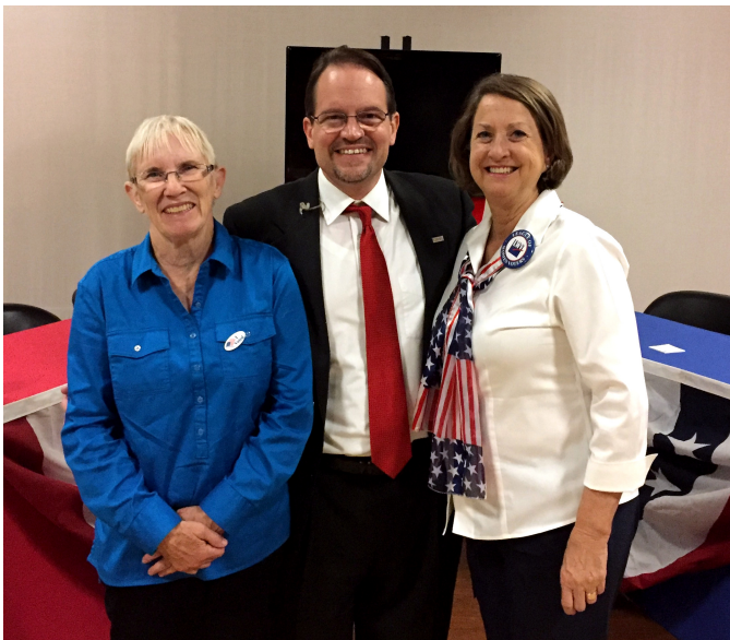
PICTURE: Candidate Forum, Oct. 13, 2016

Special thanks to KRWG Public Media for hosting the NM Legislative Forums in September and October and to Dona Ana County Government Center for hosting the Dona Ana Candidate Forum, October 4, 2016.